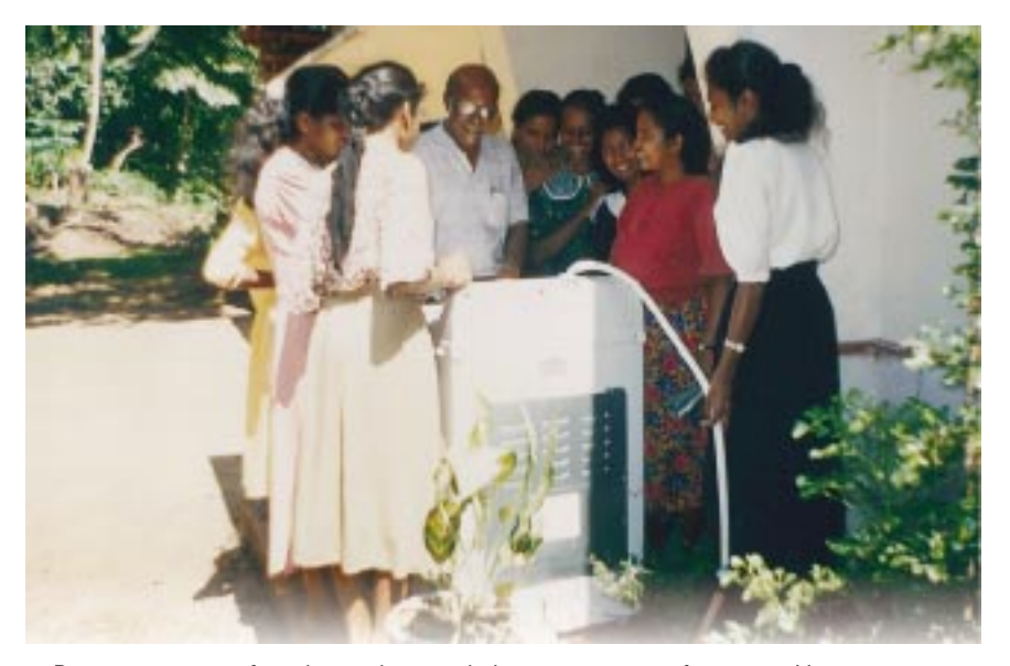
Demonstration in use of a washing machine given by Instructor to a group of prospective Migrants prior to Departure Migrant Worker Association Dehiwala

Industrial labor discipline and manners, labor security.